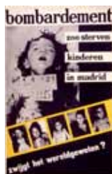
Poster, Bombardement zoo sterven kinderen in Madrid [Bombardment This Is How Children Die in Madrid] , 1936 Designed by Cas Oorthuys (Dutch, 1908-75) Publisher unknown, Netherlands Commercial color lithograph 35 x 23 in (88.9 x 58.4 cm) The Wolfsonian-Florida International University, Miami Beach, Florida, The Mitchell Wolfson, Jr. Collection TD1988.48.5