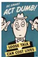
Poster, Be Smart Act Dumb! Loose Talk Can Cost Lives , 1942 Designed by Otto Soglow (American, 1900–1975) Published by British and American Ambulance Corps, Inc., New York, New York Color lithograph 20 1/8 x 14 1/4 in (51.1 x 36.2 cm) The Wolfsonian–Florida International University, Miami Beach, Florida, Gift of The Ringling School of Art and Design, Sarasota, Florida 1993.1.40