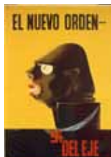
Poster, El Nuevo Orden...del Eje [The New Order...of the Axis Powers] , 1941–45 Designed by Edward McKnight Kauffer (American, 1890-1954) Published by the Coordinator of the Office of Inter-American Affairs, Washington, DC Commercial color lithograph 39 3/4 x 28 1/2 in (101 x 72.4 cm) The Wolfsonian-Florida International University, Miami Beach, Florida, The Mitchell Wolfson, Jr. Collection TD1989.184.13