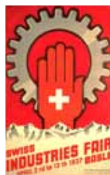
Poster, Swiss Industries Fair 1937 Basle , 1937 Designed by HzK (Nationality and dates unknown) Publisher unknown, Geneva, Switzerland Commercial color lithograph 40 1/8 x 25 1/8 in (101.9 x 63.8 cm) The Wolfsonian-Florida International University, Miami Beach, Florida, The Mitchell Wolfson, Jr. Collection 85.4.89