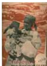
Poster, The Yugoslav Participation at the New York World's Fair, 1939 Designer and publisher unknown Lithograph 30 3/8 x 21 3/8 in (77.2 x 54.3 cm) The Wolfsonian-Florida International University, Miami Beach, Florida, The Mitchell Wolfson, Jr. Collection TD1991.174.13