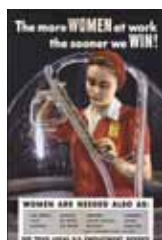
Poster, The More Women at Work the Sooner We Win! , 1943 Designer unknown Published by the US Office of War Information, Washington, DC Printed by the US Government Printing Office, Washington, DC Commercial color lithograph 22 1/8 x 13 7/8 in (56.2 x 35.2 cm) The Wolfsonian-Florida International University, Miami Beach, Florida, Gift of Leonard A. Lauder 2007.12.33