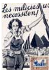
Postcard, Les Milicies us necessiten [The Militias need you!] , c.1936 Designer unknown Published by Comissariat de Propaganda de la Generalitat de Catalunya, Barcelona 5 1/2 x 3 1/2 in (14 x 9 cm) The Wolfsonian-Florida International University, Miami Beach, Florida, The Mitchell Wolfson, Jr. Collection XB1991.1180