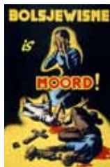
Poster, Bolsjewisme is moord! [ Bolshevism is Murder! ], c. 1942 Designer unknown Published by Dept. v. volksvoorlichting en kunsten, The Netherlands Commercial color lithograph 42 x 29 3/4 in (106.7 x 75.6 cm) The Wolfsonian-Florida International University, Miami Beach, Florida, The Mitchell Wolfson, Jr. Collection TD1995.31.1