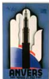
Poster, Anvers: Port Mondial et Ville d'Art [Antwerp: World Port and City of Art] , date unknown Designed by De Roeck (Nationality and dates unknown) Publisher unknown Printed by De Smet, Antwerp, Belgium Color lithograph 39 3/8 x 24 1/4 in (100.0 x 61.6 cm) The Wolfsonian-Florida International University, Miami Beach, Florida, The Mitchell Wolfson, Jr. Collection XX1992.231