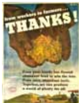
Poster, From Workers to Farmers... Thanks! , c. 1945 Designed by Ben Shahn (American, b. Lithuania, 1898-1969) Publisher unknown Color lithograph 39 7/8 x 30 1/4 in (101.3 x 76.8 cm) The Wolfsonian-Florida International University, Miami Beach, Florida, The Mitchell Wolfson, Jr. Collection XX1990.2891