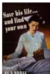
Poster, Save His Life ... and Find your Own , 1943 Designer unknown Published by the US Office of War Information, Washington, DC Printed by the US Government Printing Office, Washington, DC Commercial color lithograph 22 1/4 x 13 7/8 in (56.5 x 35.2 cm) The Wolfsonian-Florida International University, Miami Beach, Florida, Gift of Leonard A. Lauder 2007.12.29