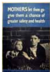
Poster, Mothers Let Them Go-Give Them a Chance of Greater Safety and Health , c. 1940 Designer unknown Published by His Majesty's Stationery Office, London Printed by J. Weiner Ltd., London Commercial color lithograph 29 3/4 x 20 in (75.6 x 50.8 cm) The Wolfsonian-Florida International University, Miami Beach, Florida, Gift of The Ringling School of Art and Design, Sarasota, Florida 1993.1.49