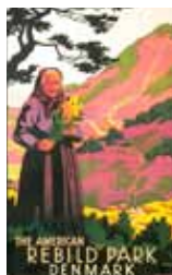
Poster, The American Rebild Park Denmark , 1929 Designer unknown Published by Turistforening en for Danmark, Copenhagen, Denmark Printed by Winther & Winther, Copenhagen, Denmark Color lithograph 39 7/8 x 24 3/8 in (101.3 x 61.9 cm) The Wolfsonian-Florida International University, Miami Beach, Florida, The Mitchell Wolfson, Jr. Collection XX1992.218