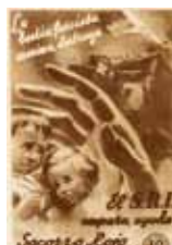
Postcard, La bestia fascista, asesina, destruye: el S.R.I. ampara, ayuda / Socorro Rojo Internacional [The fascist beast murders, destroys: the S.R.I. protects, helps / International Red Aid] , c. 1937 Designer unknown Published by Socorro Rojo Internacional, Spain 5 1/2 x 4 in (14 x 10 cm) The Wolfsonian-Florida International University, Miami Beach, Florida, The Mitchell Wolfson, Jr. Collection XB1994.194