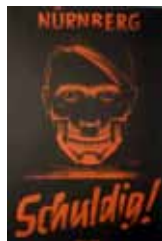
Poster, Nürnberg! Schuldig! [Nuremberg! Guilty!], 1946 Designed by Jürgen Freese (German, dates unknown) Published by Zentralverwaltung für Volksbildung in der sowjetischen Besatzungszone, Berlin Color lithograph 45 1/8 x 35 in (114.6 x 88.9 cm framed) The Wolfsonian-Florida International University, Miami Beach, Florida, Purchase, Curatorial Discretionary Fund 2000.6.1