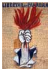
Study, Libertad de Palabra [Freedom of Speech] , 1941 Designed by Herbert Bayer (American, b. Austria, 1900-85) New York, NY Pastel and graphite on paper 10 1/8 x 7 1/8 in (25.7 x 18.1 cm) The Wolfsonian-Florida International University, Miami Beach, Florida, The Mitchell Wolfson, Jr. Collection TD1994.36.