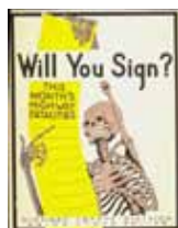
Poster, Will You Sign? , c. 1935 Designer unknown Produced for Works Progress Administration, Maine Screenprint 21 7/8 x 16 7/8 in (55.6 x 42.9 cm) The Wolfsonian-Florida International University, Miami Beach, Florida, The Mitchell Wolfson, Jr. Collection TD1989.90.17