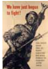
Poster, We Have Just Begun to Fight! , 1943 Designer unknown Published by the US Office of War Information, Washington, DC Printed by the US Government Printing Office, Washington, DC Commercial color lithograph 40 x 28 1/2 in (101.6 x 72.4 cm) The Wolfsonian-Florida International University, Miami Beach, Florida, Gift of The Ringling School of Art and Design, Sarasota, Florida 1993.1.97