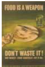
Poster, Food Is a Weapon. Don't Waste It! , 1943 Designer unknown Published by US Office of War Information, Washington, DC Printed by US Government Printing Office, Washington, DC Commercial color lithograph 22 3/4 x 16 in (87.8 x 40.6 cm) The Wolfsonian-Florida International University, Miami Beach, Florida, Gift of Leonard A. Lauder 2007.12.30