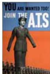
Poster, You are Wanted Too! Join the A.T.S. , 1941 Designer unknown Published by His Majesty's Stationery Office, London Printed by A.C. Ltd., London Commercial color lithograph 30 x 20 in (76.2 x 50.8 cm) The Wolfsonian-Florida International University, Miami Beach, Florida, Gift of The Ringling School of Art and Design, Sarasota, Florida 1993.1.86