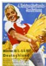
Poster, 4. Reichsnährstands-Ausstellung München, 30.5 - 6.6. 1937 [Fourth State Food Producers' Exhibition] , 1937 Designed by Ludwig Hohlwein (German, 1874-1949) Printed by Deutsche Landwerbung GmbH, Berlin Commercial color lithograph 32 7/8 x 23 1/4 in (83.5 x 59.1 cm) The Wolfsonian–Florida International University, Miami Beach, Florida, The Mitchell Wolfson, Jr. Collection XX1990.2850