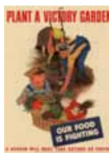
Poster, Plant a Victory Garden , 1943 Designer unknown Published by United States Office of War Information, Washington, DC Printed by United States Government Printing Office, Washington, DC Commercial color lithograph 27 3/4 x 22 1/8 in (70.2 x 56.2 cm) The Wolfsonian-Florida International University, Miami Beach, Florida, Gift of Leonard A. Lauder 2007.12.45