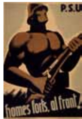
Poster, Homes forts, al front! [Strong men, to the front!] , 1936 Designer unknown Published by Partit Socialista Unificat de Catalunya (PSUC), Sindicat de Dibuixants Professionals (SDP), and Unió General de Treballadors (UGT), Barcelona Printed by Gráficas Ultra, Barcelona Commercial color lithograph 38 3/4 x 27 3/8 in (98.4 x 69.5 cm) The Wolfsonian-Florida International University, Miami Beach, Florida, The Mitchell Wolfson, Jr. Collection XX1992.179