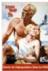
Poster, Neues Volk 1938 [New People] , for the calendar of the Rassenpolitischen Amtes der N.S.D.A.P. [Racial Policy Office of the Nazi Party], 1938 Design attributed to Ludwig Hohlwein (German, 1874-1949) Published by Rassenpolitisches amt der N.S.D.A.P., Berlin Commercial color lithograph 16 1/2 x 11 5/8 in (43.9 x 29.5 cm) The Wolfsonian-Florida International University, Miami Beach, Florida, The Mitchell Wolfson, Jr. Collection XX1990.2734